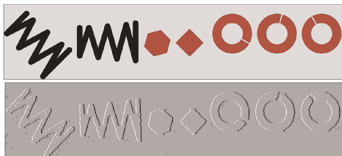
Stimulus (above picture)

The 2x256 pixel dynamic vision sensor asynchronously reacts to relative light intensity changes and consequently performs on-chip extraction of contours of moving objects.